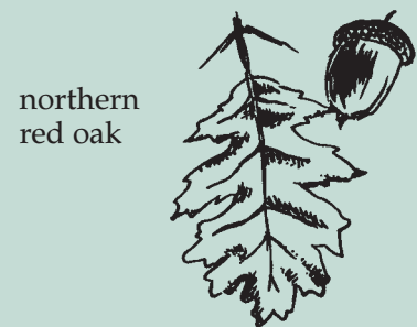
northern red oak