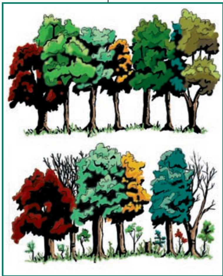
Figure 1. Comparison of a forest managed with timber stand improvement (bottom) to an unmanaged forest (top). Note the larger tree sizes and better developed understory in the managed woodland.