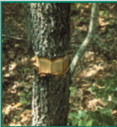
Figure 3. Girdle cutting performed with a hatchet.