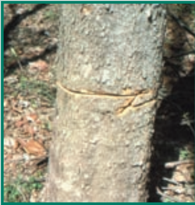
Figure 2. Girdle cutting performed with a chainsaw. Be sure to connect your cut so that it completely rings the cull tree's trunk.